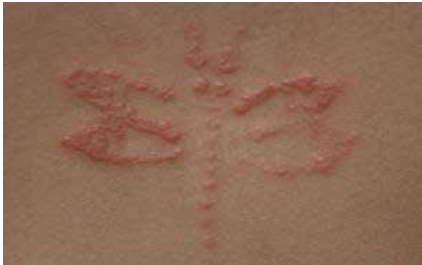
Nickel rash on skin

Sportsheets products have been nickel-free for over five years, and have been EU compliant since 2008.